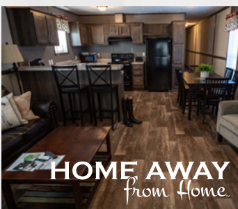
HOME AWAY from Home