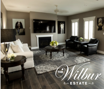
THE Wilbur ESTATE