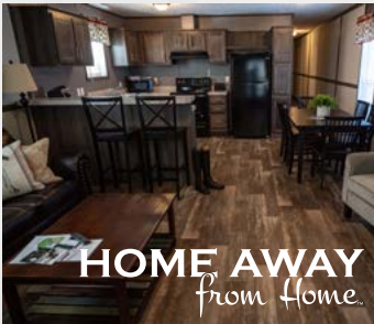
HOME AWAY from Home