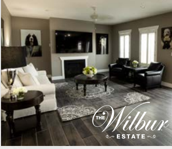
THE Wilbur ESTATE